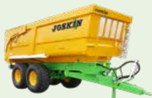
Trans-CAP 10 to 18 t • 10.2 to 21.9 m 3 DIN Length (above): 4.72 to 6.73 m Height: 1 to 1.5 m