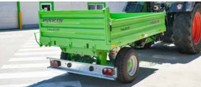
Trans-EX (8 models) 3-way tipping system (optional) Body volume: 1.9 to 9.92 m 3 DIN Payload: 3 to 9 t Single/double axle