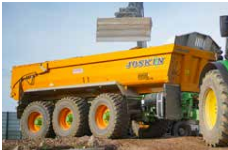
Trans-KTP (17 to 34 t)