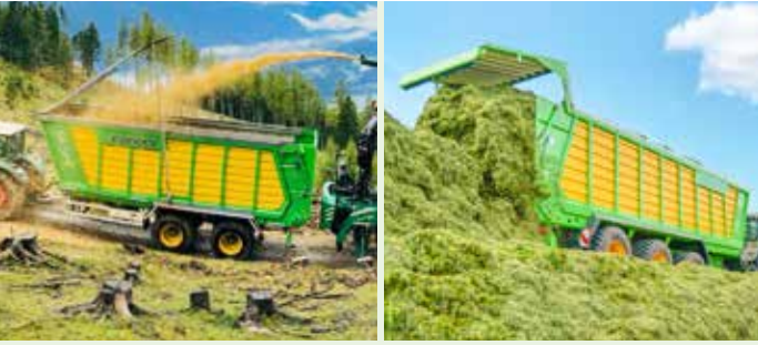
Silo-SPACE2 (4 models) Body volume: 44 to 61.18 m 3 DIN Payload: 22 to 28 t Double/triple axle