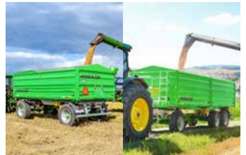
Tetra-CAP & Tetra-SPACE