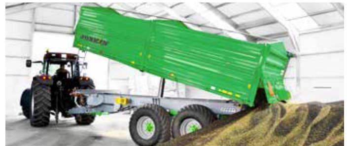
Delta-CAP (13 models) 3-way tipping system (standard) Body volume: 10.89 to 32.54 m 3 DIN Payload: 8 to 24 t Simple/double/triple axle