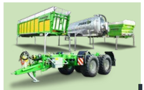
CARGO chassis + implements