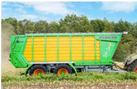
Silo-SPACE2 (silage trailer)