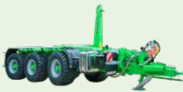
Cargo-LIFT CL 12 to 30 t • For containers from 3.2 to 7.445 m