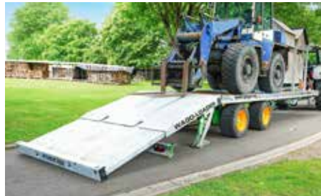
Semi-mounted WAGO-Loader (4 galvanised models) Payload: 14 or 24 t Length: 8 to 10 m Double/triple axle