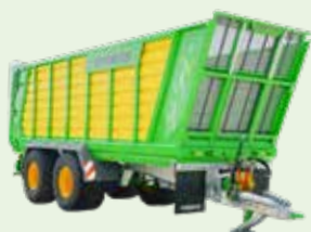
Silo-SPACE2 22 to 28 t • 44 to 59 m 3 DIN Length (above): 8.83 to 10.54 m Height: 2.28 m