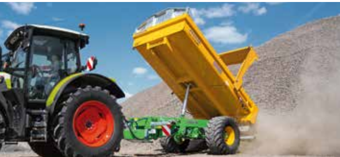
Trans-KTP 9/11/15 t (3 models) Body volume: 5.1 to 18.4 m 3 DIN Payload: 9 to 15 t Single/double axle