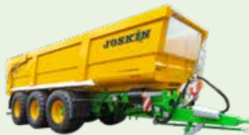
Trans-SPACE 18 to 26 t • 21.9 to 30.8 m 3 DIN Length (above): 6.73 to 9.41 m Height: 1.25 or 1.5 m