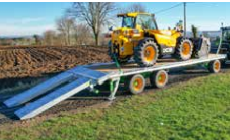
Trailed WAGO-Loader (3 galvanised models) Payload: 14 or 21 t Length: 8 or 9.9 m 2/3 axles