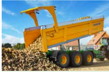
Trans-SPACE (9 models) Body volume: 21.9 to 52.4 m 3 DIN Payload: 18 to 26 t Double/triple axle