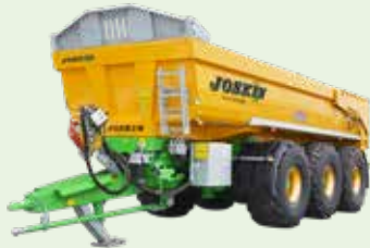
Trans-KTP 9 to 30 t • 5.1 to 17.3 m 3 DIN Length (above): 4.6 to 7.52 m Height: 0.5 to 1.05 m