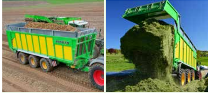
Drakkar (10 models) Body volume: 23 to 54 m 3 DIN Payload: 18 to 28 t Double/triple axle