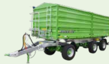
Tetra-CAP & Tetra-SPACE 8 to 24 t • 10.89 to 31 m 3 DIN Length: 4.5 to 7.5 m Height: 1 to 1.8 m