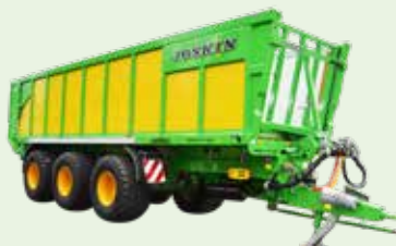
Drakkar 18 to 28 t • 23 to 46 m 3 DIN Length (above): 6.7 to 9.7 m Height: 1.5 or 1.8 m