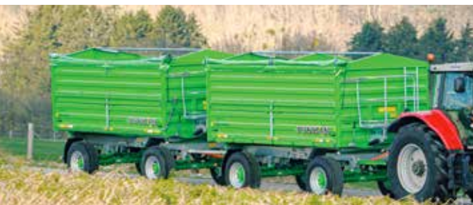
Tetra-CAP (11 models) 3-way tipping system (standard) Body volume: 10.89 to 23.2 m 3 DIN Payload: 8 to 16 t 2 axles