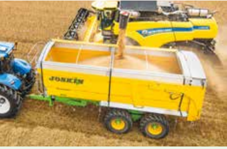
Trans-CAP (11 models) Body volume: 10.2 to 37.5 m 3 DIN Payload: 10 to 18 t Single/double axle