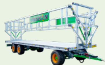
WAGO bale trailers 7 to 24 t • 6 to 11.7 m • Side ladders available on 8 and 10 m models