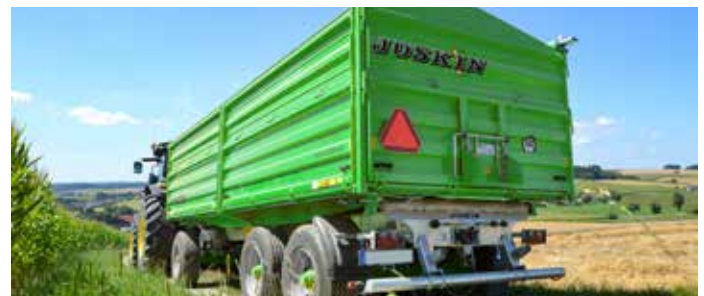
Tetra-SPACE (4 models) 3-way tipping system (standard) Body volume: 21.69 to 32.54 m 3 DIN Payload: 18 to 24 t 3 axles