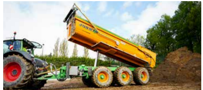
Trans-KTP 17/22/24/31/34 t (5 models) Body volume: 8.6 to 36.1 m 3 DIN Payload: 17 to 30 t Double/triple axle