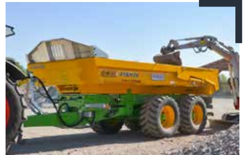
Trans-KTP (9 to 15 t)