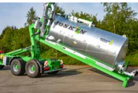
Cargo-LIFT CL (6 models) Technical load: 12 to 30 t Container length: 3.2 to 7.445 m Double/triple axle