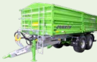
Trans-EX & Delta-CAP 3 to 14 t • 1.9 to 19.36 m 3 DIN Length: 2.86 to 6 m Height: 0.4 to 1.6 m