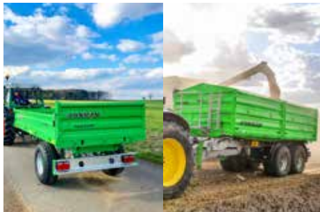
Trans-EX & Delta-CAP