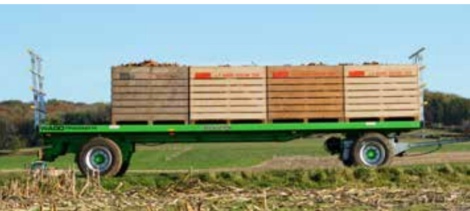
Trailed WAGO (9 painted or galvanised models) Payload: 10 to 21 t Length: 8 to 11.7 m 2/3 axles