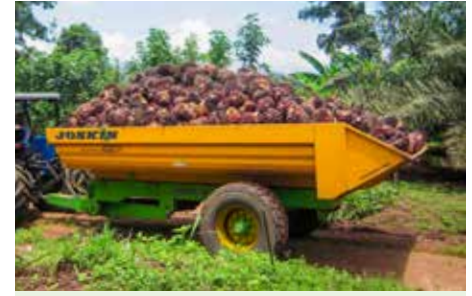
Trans-PALM (9 models) Body volume: from 6.6 m 3 DIN (extensions can be fitted by increments of 25 or 50 cm) Payload: 10 to 16 t Single/double axle