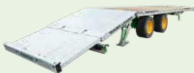
WAGO-Loader low loaders 14 to 24 t • 8 to 10 m