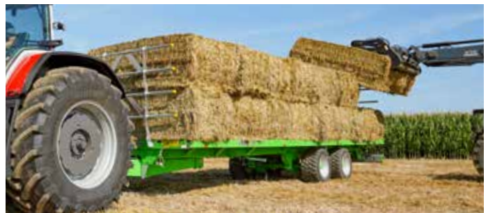
Semi-mounted WAGO (10 painted or galvanised models) Payload: 7 to 24 t Length: 6 to 11.7 m Simple/double/triple axle