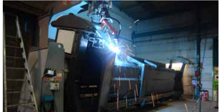
Expertise in production automation