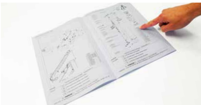
Expertise in spare parts with an individualised spare parts book generated automatically with the chassis number