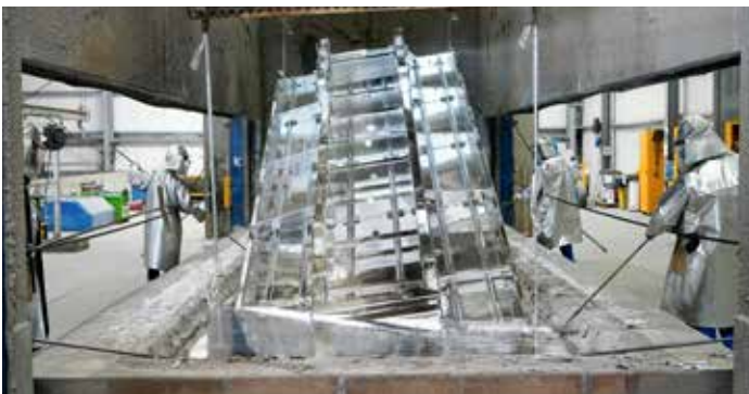
Expertise in surface treatment (galvanising and painting) for a quality assurance