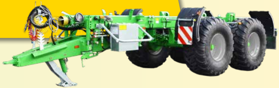
Ferti-CARGO (3 models)

Chassis length: 6 m (20 t) or 7.1 m (28 t) Double/triple axle