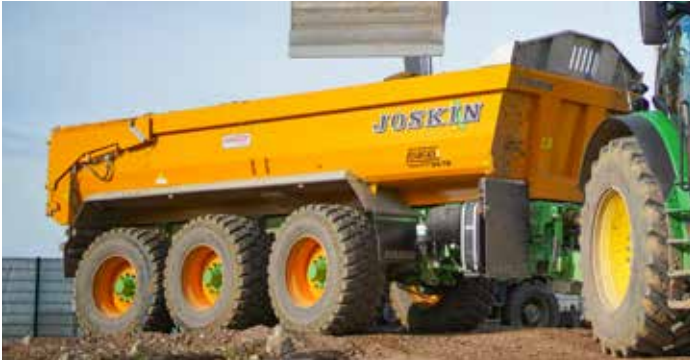
Expertise in agricultural and civil engineering transport