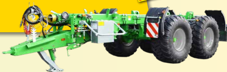
Ferti-CARGO (3 models)